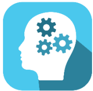
Creative and Critical Thinker